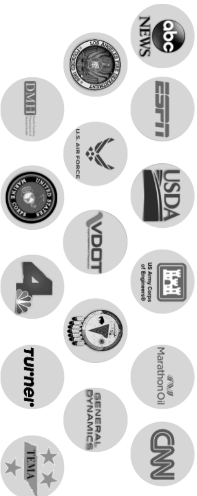
All trademarks and logos belong to their respective organizations.