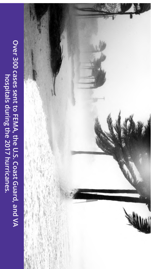
Over 300 cases sent to FEMA, the U.S. Coast Guard, and VA hospitals during the 2017 hurricanes.

While Plum has limited resources, kindness and humanitarian values are a part of Plum's culture. The first Plum Case ever produced was donated.